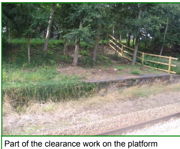
Part of the clearance work on the platform