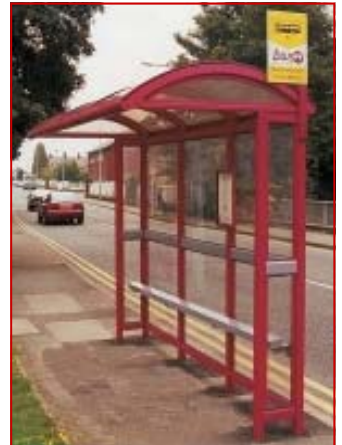
The Queenbury 'Arun' shelter (Croston's shelter will be Moss Green in colour)

under its Parish and Town Council Bus Shelter Grant Scheme where LCC provides funding for the shelter and the Parish Council takes on the ongoing maintenance, cleaning, power supply etc.