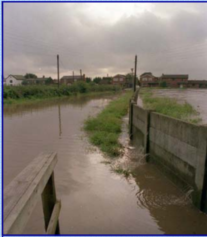
Previous flooding in the village (1987)

The next meeting of the Community Flood Action Group is likely to be held in April/May. We'll be ringing the group to let them know the exact date nearer the time. At that stage, we'll also put posters up around the village to advertise the details.