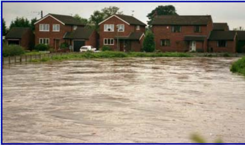
Previous flooding in the village

The more people who are involved, either because they live in a flood risk area or