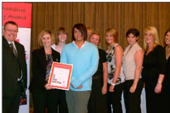
Staff from Croston Acorns receiving the Award

The management, staff and parents are really proud of our achievement and the nursery will continue on through the Quality awards.