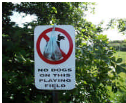
We hope the bin will end this type of behaviour by dog walkers