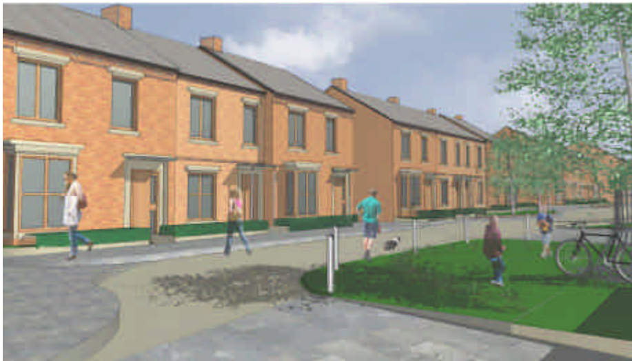
Artists impression of the Moor Road site

Should there not be enough families with a local connection to Croston to fill all the houses, priority to any properties still to be filled will be given to families with a local connection to the parishes of Bretherton and Eccleston.