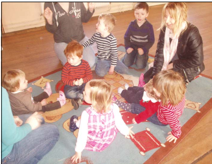
The Tots Group in action.

Hello mum's, dad's, carers. Are you looking for somewhere to go between 9.30am and 11.30am on a Tuesday or Thursday morning? Come along to the Community Centre, Castle Walks and meet up with other mums and dads and carers.