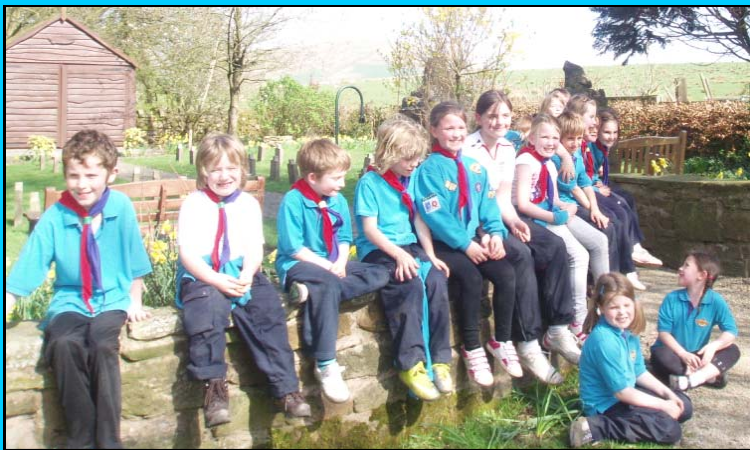
Beavers from today - Members of our current Colony.

As part of our celebrations we would like to invite any of our 'old' Beavers, Scouts and Leaders to join us on Coffee Day (Saturday 2 July) to walk with us. Meet at Church for the service at 1.45pm or about 2.00pm for the walk.