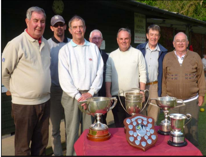
Members of Croston Subscription Bowling Club with last season's trophies.

The Club had a very successful year in 2010. The trophies won last year were Chorley and District 1st and 3rd