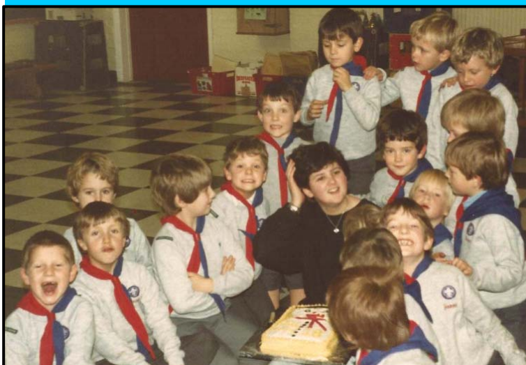
Beavers from 25 years ago - are you in the photo, or do you recognise anyone who is?

Croston started its first Colony in September 1986 - were you a member of that Colony? We have gone from strength to strength in Croston and this is due to the great start we had. We've seen some changes - it was all boys at first and the uniform was grey with a turquoise knacker. If I remember Croston was one of the first colonies to wear their own knacker which made life easier on district events to 'spot' our Beavers! Then we got our new uniform, which we still wear, and around 2007 started taking girls into the Scout movement.